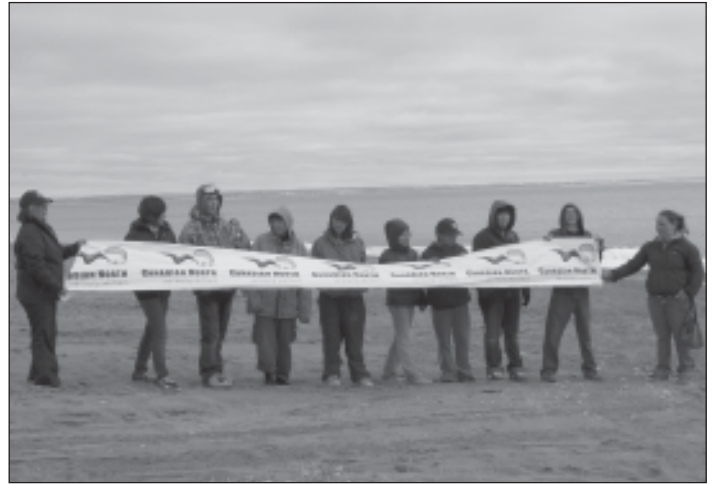
In 2009, Canadian North provided support to Sachs Harbour for their IFA 25 th Anniversary Celebrations. Go Canadian North go!

So far this year, Canadian North has supported many northern events including: Town of Inuvik CPSA, Inuvik Youth Centre, IRC Native Hockey Tournament, Muskrat Jamboree, Skate North, Daffodil Day for Canadian Cancer Society, Inuvik Junior Boys and Girls Curling Teams. As well, Canadian North provides travelling and discount for many high school teams and for youth minor hockey travelling south for tournaments. ■